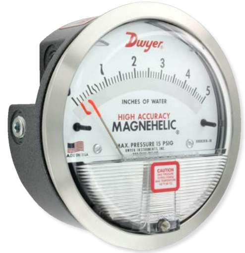
Note: Shown with optional -SS bezel