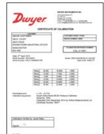
6-Point Calibration Certificate Included

The SERIES 2000-HA High Accuracy Magnehelic® Gage is twice as accurate as the standard Magnehelic® gage. The well-engineered High Accuracy Magnehelic® Gage offers a mirrored overlay as standard in order to eliminate any parallax error when taking measurements. A six point calibration certificate is included with each high accuracy model. The rugged IP67 casing helps fully protect against dust and water ingress. The redesigned corrosion resistant brushed 304 stainless steel bezel option offers a clean tapered design, yet minimizes the possibility of any dust accumulation on the edges.